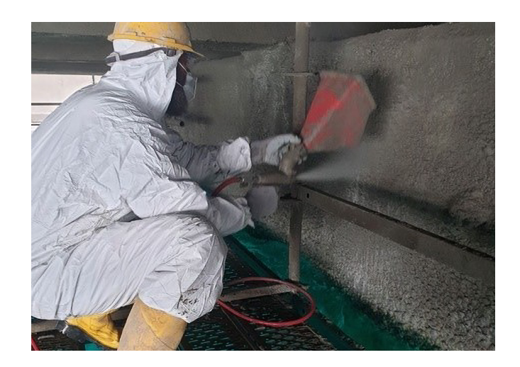
ENKA SA's expertise in the field, combined with Xypex Concentrate's advanced technology, ensured the successful completion of this project.

Xypex Concentrate's advanced crystalline technology proved to be the most suitable choice, providing a long-lasting and cost-effective solution.